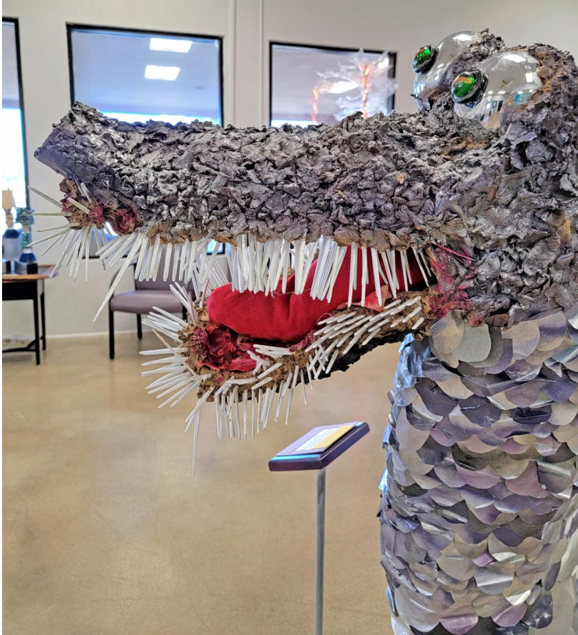
Recycle Dragon Sculpture

For the ninth year, WHAM is having the Annual Recycle show in the WHAM Gallery.