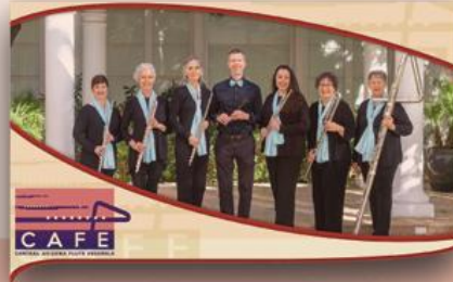
Central Arizona Flute Ensemble

The program, facilitated by leading humanities professors, will build meaning and create dialogue about how artists and composers express their ideas, and how audiences process them. This free interdisciplinary event invites artist and audience participation!